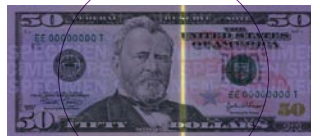
Without Fake Finder™ Verification